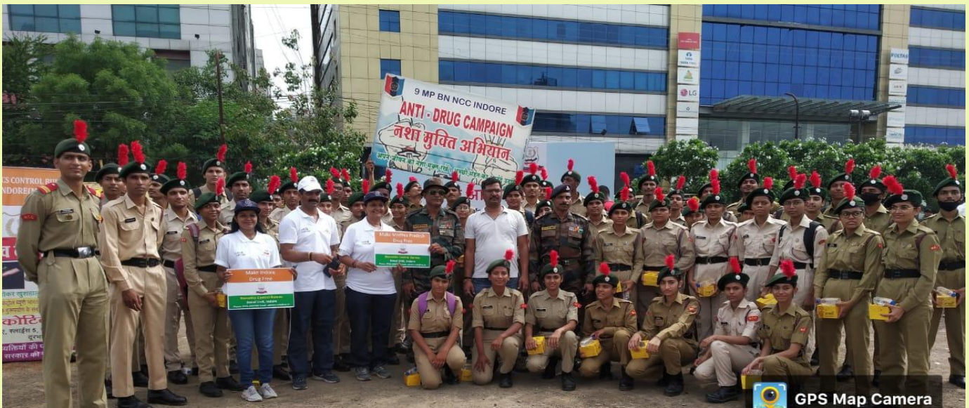
Shri Atal Bihari Vajpai Government Arts & Commerce College, Indore Quarterly E-News Magazine (April - June, 2022) Volume – 2