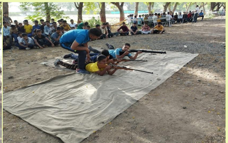
Shri Atal Bihari Vajpai Government Arts & Commerce College, Indore Quarterly E-News Magazine (April - June, 2022) Volume – 2